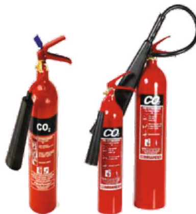
Co 2 COME IN STANDARD SIZE FROM 2KG & 6KG PORTABLE EXTINGUISHER TO 10KG TROLLEY