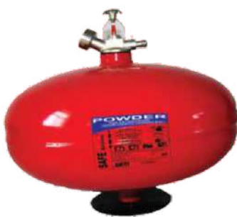
AUTOMATIC FIRE EXTINGUISHER