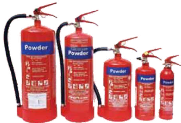
PORTABLE DCP EXTINGUISHERS COME IN ALL SIZE FROM 1KG-12KG