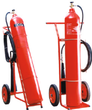
CARBON DIOXIDE TROLLEY

Carbon dioxide gives fast, safe and effective protection for fires involving electrical equipment and flammable liquids. CO 2 is recognized for its non liquids. CO 2 is recognized for its non damaging, highly effective performance today's office environments and cleanliness. They are generally suited for indoor use, making them ideal for.