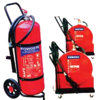
DCP PORTABLE TROLLEY